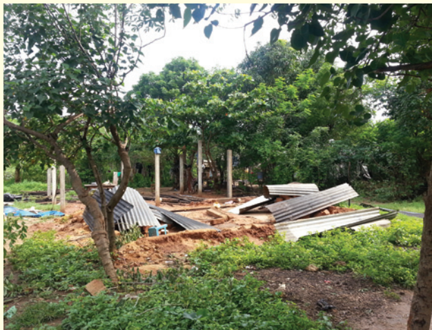
Collapsed huts, Camp Sabhapatthy

A young widow in her 30s, [REDACTED] lives with her elderly mother. With no way to earn a livelihood, she has no sense of future. She and her mother had stayed up the night before as the monsoon rain streamed in from all sides of the hut. In a corner of the hut is their wet bedding, which is not going to dry for a while, as more clouds are gathering, darkening the sky and portending more storms. Mother and daughter pray for a night without rain.