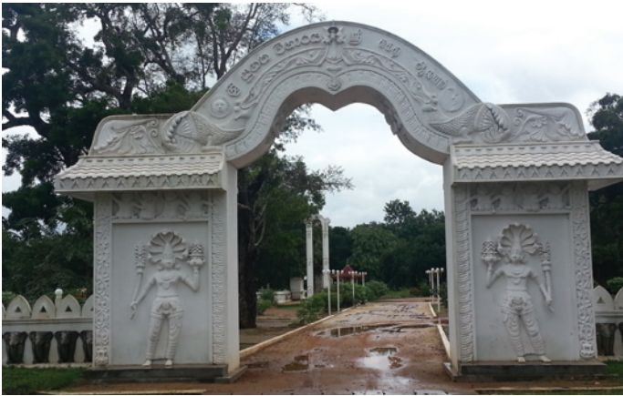
Entrance to Mankulam Sri Sugatha Viharaya

SFHQ–KLN troops and Engineer Service Regiment troops reportedly even lent their expertise for the construction. 125