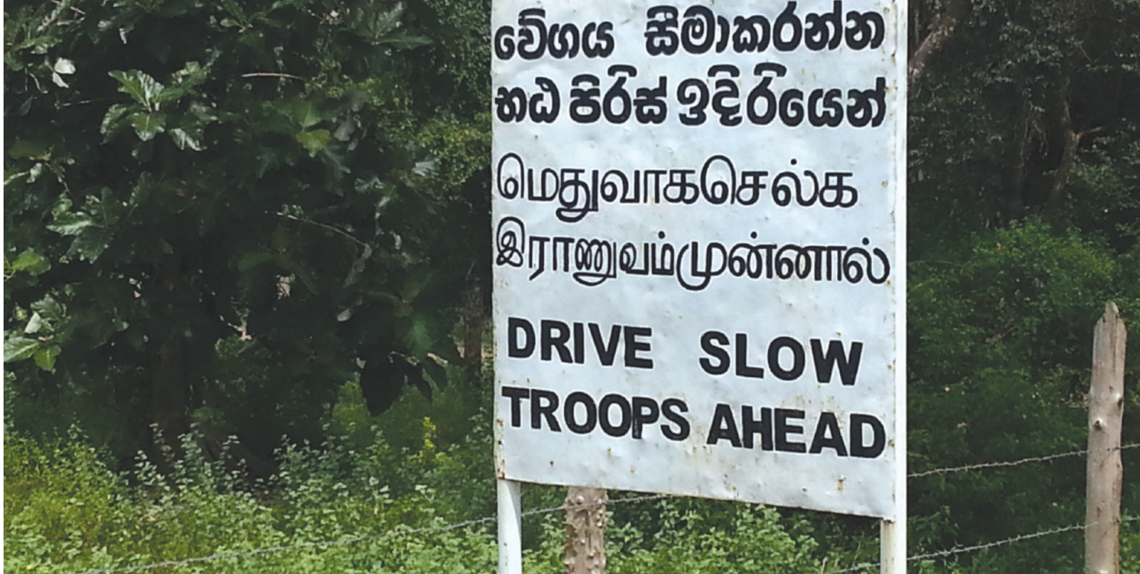
Road sign, Jaffna

free flow of trade in the Indian Ocean. . . . Sri Lanka's strategic importance to the United States, China, and India is viewed by some as a key piece in a larger geopolitical dynamic, what has been referred to as a new 'Great Game.' 134