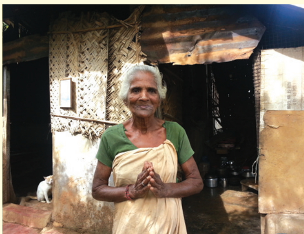
A resident at Camp Sabhapatthy

Following the heavy rainfall the night before, many houses were vacated—the thatched roofs had caved in and some houses were flooded. Overcrowded neighboring homes were taking in the displaced neighbors to provide a roof over their heads. “Initially, UNHCR provided the materials to build these homes—25 years ago. With all UN agencies and NGOs removed by the government, we are on our own and look after the other.” 65