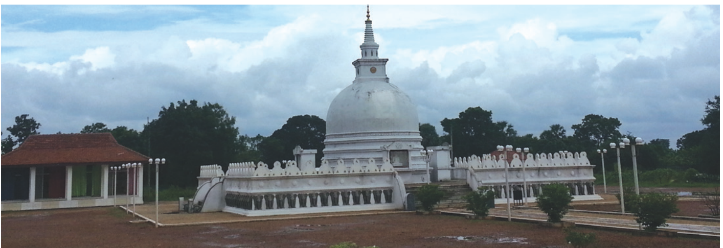
Mankulam Sri Sugatha Viharaya

Such moves have changed the demography of the Trincomalee district. In 1881, the percentage of Sinhalese in the area was 4.2 percent; the population had increased to 27 percent by 2012. At the same time, the percentage of the population that is Tamil decreased from 64.4 percent in 1881 to 30.6 percent in 2012 (the rest of the population is mostly Muslim, a minority primarily present in some coastal towns). 128