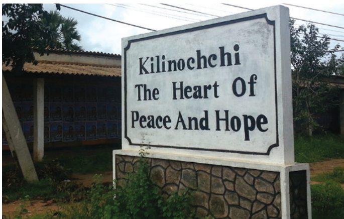
Welcome to Kilinochchi

LTTE bunkers, supposedly used by the LTTE leader Prabhakaran—including a swimming pool, in which Sea Tigers practiced diving, and “main terrorists” houses—have been converted into tourism spots. There are also open-air sites displaying an armored vehicle, a submarine, and Farah, a Jordanian ship that was seized by the LTTE in 2006. 116