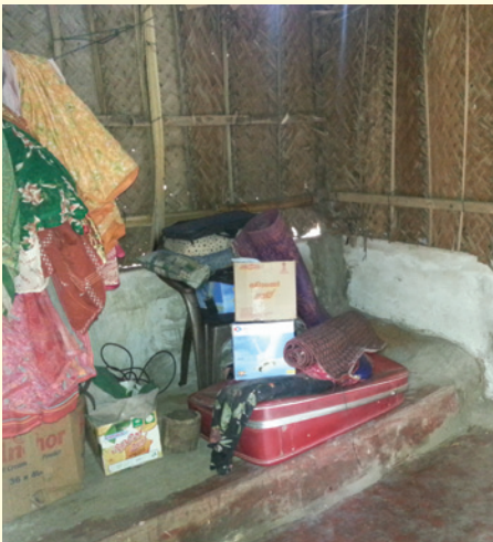
Inside of a home, Camp Sabhapathy