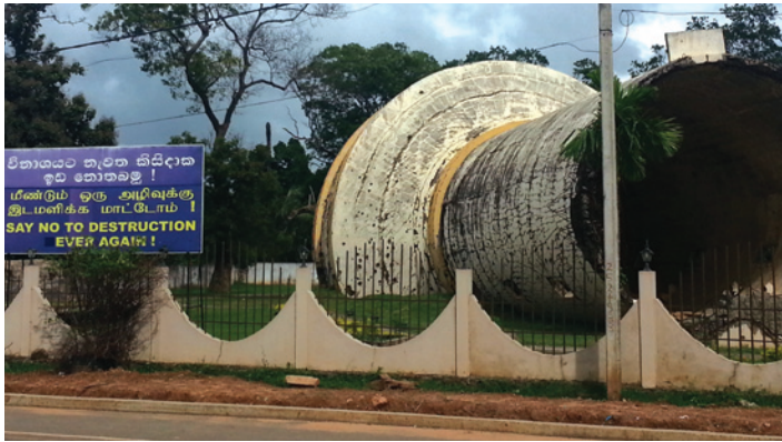
Kilinochchi destroyed water tank