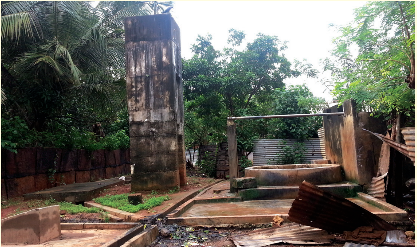
Bathing area for men, Camp Neethavan

The Oakland Institute researchers were able to visit Camp Neethavan which houses some 200 people (57 families), with 60 school-age children and 25 senior citizens. 58 The public facilities at the camp are minimal—two small water tanks (which need to be filled around five times a day so families can fill jerry cans to carry back home), an enclosed common area for bathing and washing clothes for women, and eight toilets that are not easily accessible in the dark, making it especially hard for the elderly, young women, and children to use the facilities at night. Most homes have tin or bamboo roofing and use cardboard and plastic sheets to close the gaping holes, and have no electricity. As evening descends, families light up rusted lanterns. During the day, families scour the area for wood that is used for cooking.