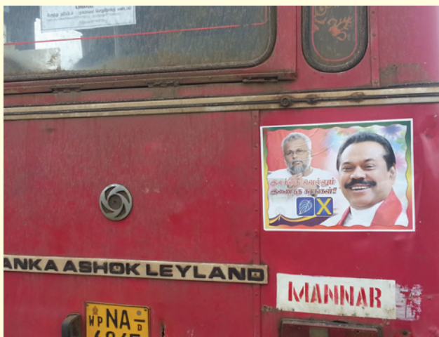
Election campaign bus

Only 17 to 20 families in the camp have electricity. Residents report that the candidates participating in the January 2015 elections have promised electricity.