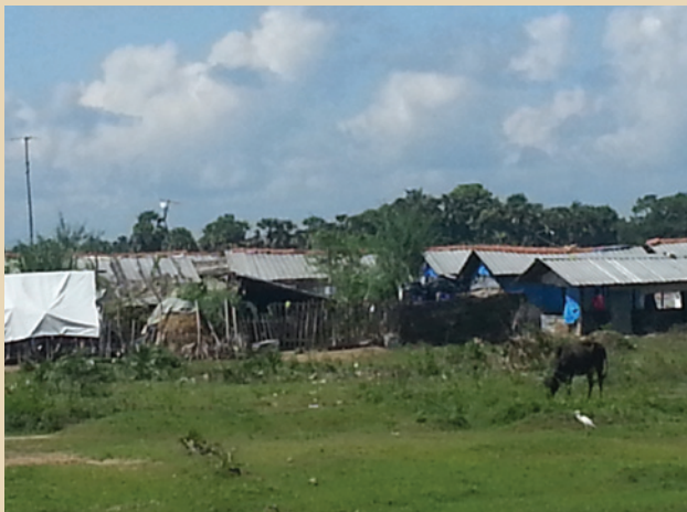
Sampoor IDP Camp

No NGO can provide support to us. All NGOs have to obtain permission from the Government Agent in the area, a former army major general. We have lost everything—our culture, our history, temples, schools, livelihoods. Now I just wish for our children to be educated. But who can help?