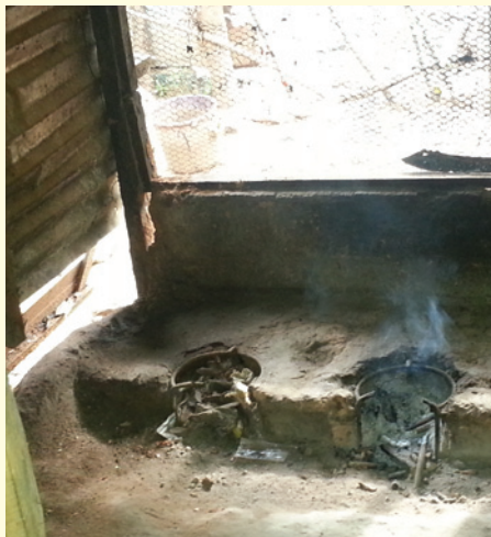
Kitchen inside a hut at Camp Neethavan