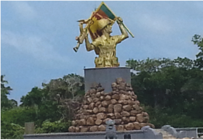
War Hero Memorial, Mullaitivu

oblivious to the grief of the Northern Tamils who faced the brutal Sri Lankan Army assault, which is estimated to have killed tens of thousands of civilians toward the end of the war.