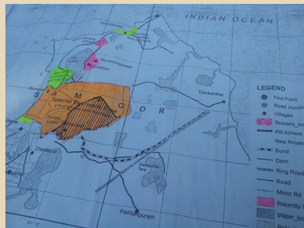
Map of Sampoor