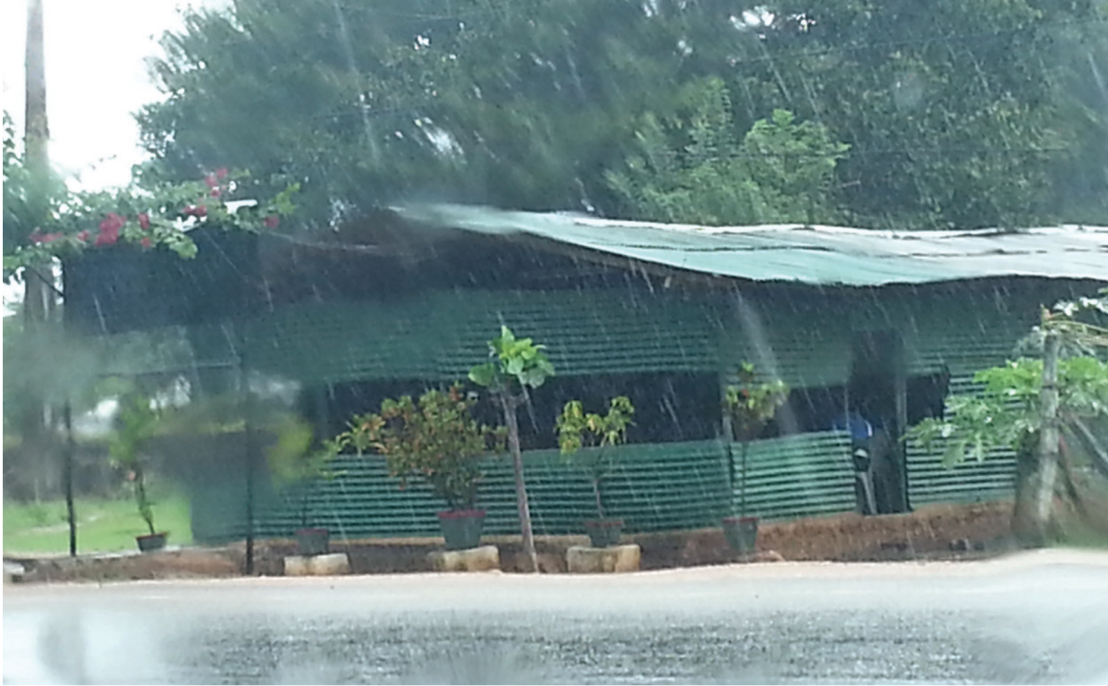
Army checkpoint at Omanthai