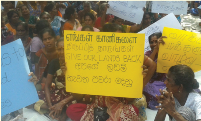
IDPs from Sampoor on hunger strike, February 2015

Targeted by the Sri Lankan forces in April 2006, Sampoor's population—mainly Tamil—fled amid heavy shelling, leaving behind homes, farms, and fishing grounds. Celebrating the takeover of Sampoor, President Rajapaksa declared, "Our armed forces have captured Sampur for the welfare and benefit of the people living there." 37 The reality could not be more different.