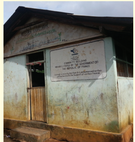
Community center, Camp Sabhapathy

The residents are former fisherfolk, farmers, and cattle herders from Palaly and Majiliddi. “Today our livelihoods are nonexistent. We cannot fish anymore, and neither do we have the grazing grounds to keep the cattle. We look for any job—coolie, day laborer, anything—to survive.” 59