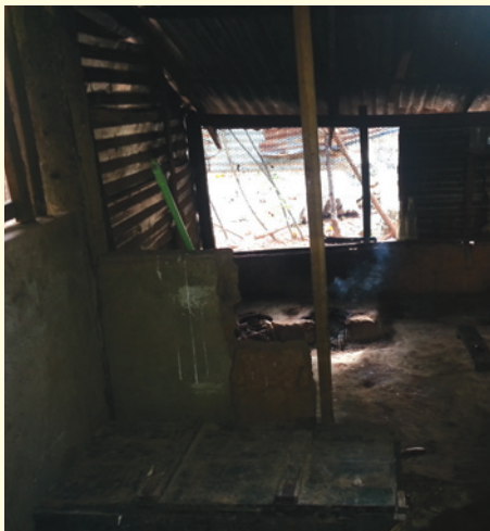
Inside of a hut, Camp Neethavan