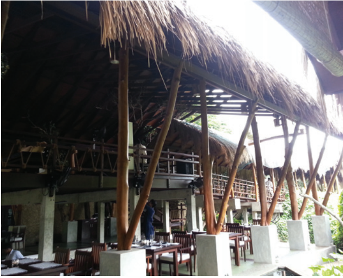
Jungle Beach Resort, Kuchaveli

The Jungle Beach Resort sits between the Indian Ocean and the Periyakarachchi Lagoon, which is surrounded by mangroves and scrublands along with smallholder farming and cultivation of rice and coconut. 107 In addition to the important environmental role played by the lagoons, mangrove ecosystems are also key to environmental well-being. Known for buffering the force of tsunami waves, they are instrumental in supporting the livelihoods of local coastal communities, perform vital hydrological functions, and serve as breeding grounds for fish and other marine species. 108