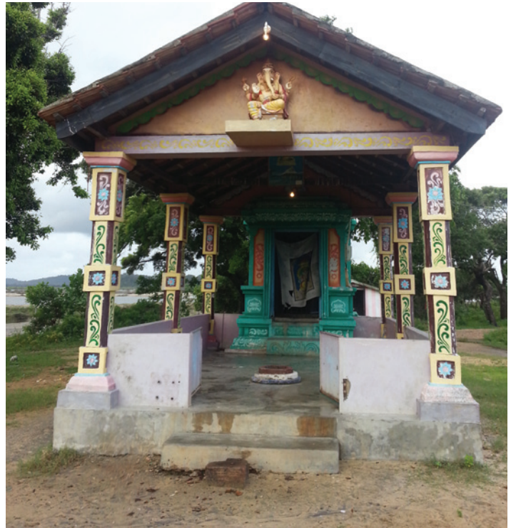
Piliyar temple built by Raigam Saltern

With no jobs available at the saltern, the locals have been forced into desperation; one option is to work with trawlers engaged in deep sea fishing. "We are no longer fishermen, but just menial laborers on big ships," a resident of the fishing village reported. "My community, some 280 families, were devastated by the 2004 tsunami and provided homes by the Australia Red Cross. Raigam's takeover of our lands is another tsunami for us. . . . far worse than what we faced in 2004." 103