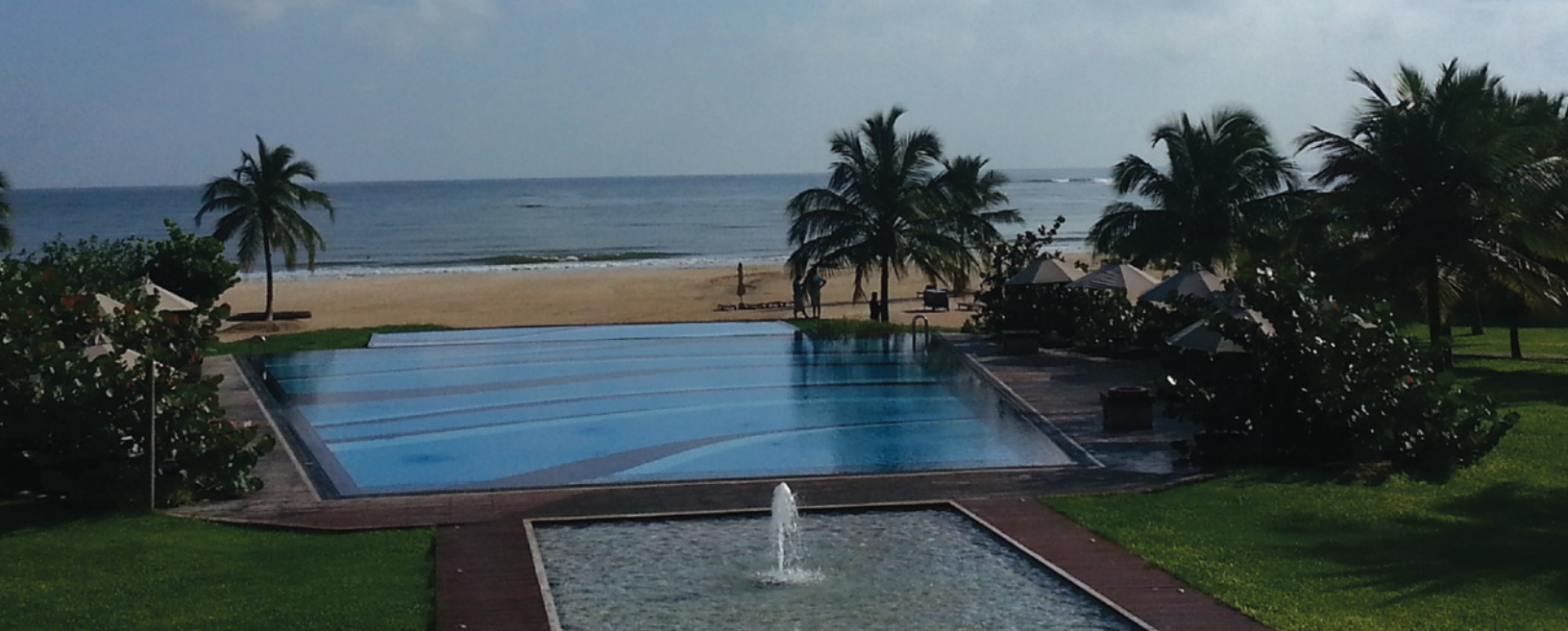
Uga Bay Resort, Passikudah, Baaticaloa