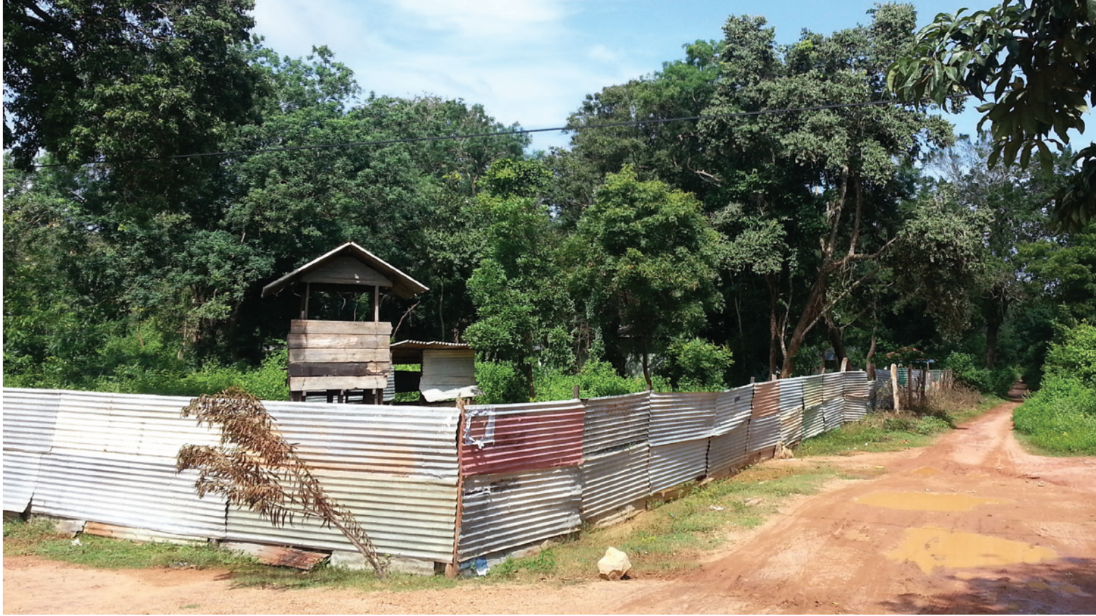
Army camp, Mullaitivu