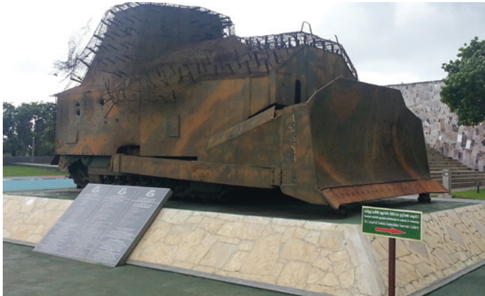
“Terrorist” bulldozer on display, Elephant Pass