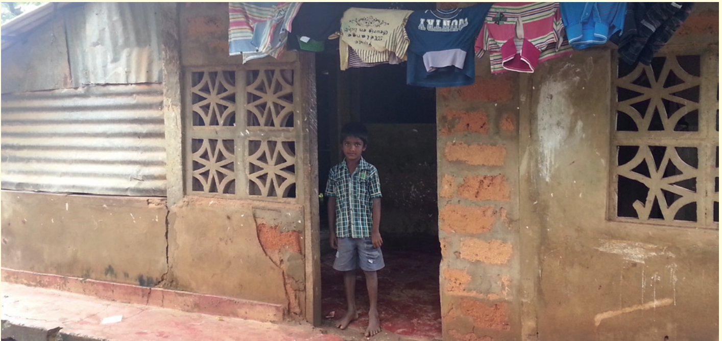
Left alone, Camp Sabhapathy