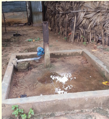
Broken faucet, Camp Sabhapathy