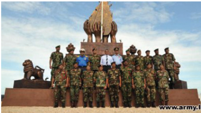
War Hero Memorial