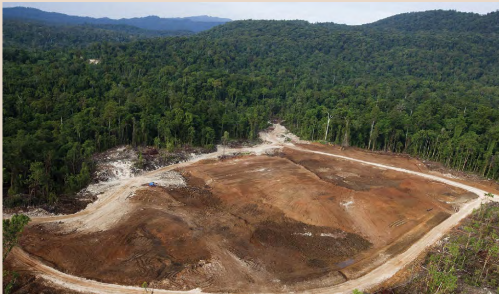
Logging concessions in Pomio

We have been struggling for some years now. I want to appeal to the government to give our land back. The project is really not doing anything good for the people of Pomio. What I want to say to the government of PNG today is that the people of Pomio are Papua New Guineans, and what has happened to us is something that is hard for us to take because our land has been taken away and given to foreigners to use through SABLs. We have lost our land.