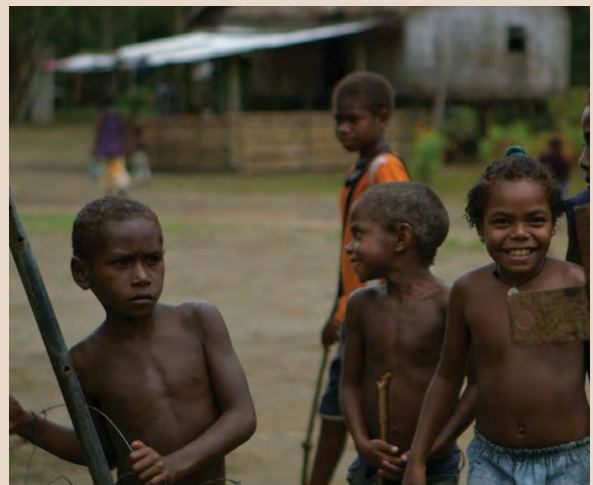
Mosa Village, West New Britain

Development brought in dwellers. Not local people, but people who were brought in here, searching for a job, to make ends meet. So really, I feel like I'm a stranger in my own land.