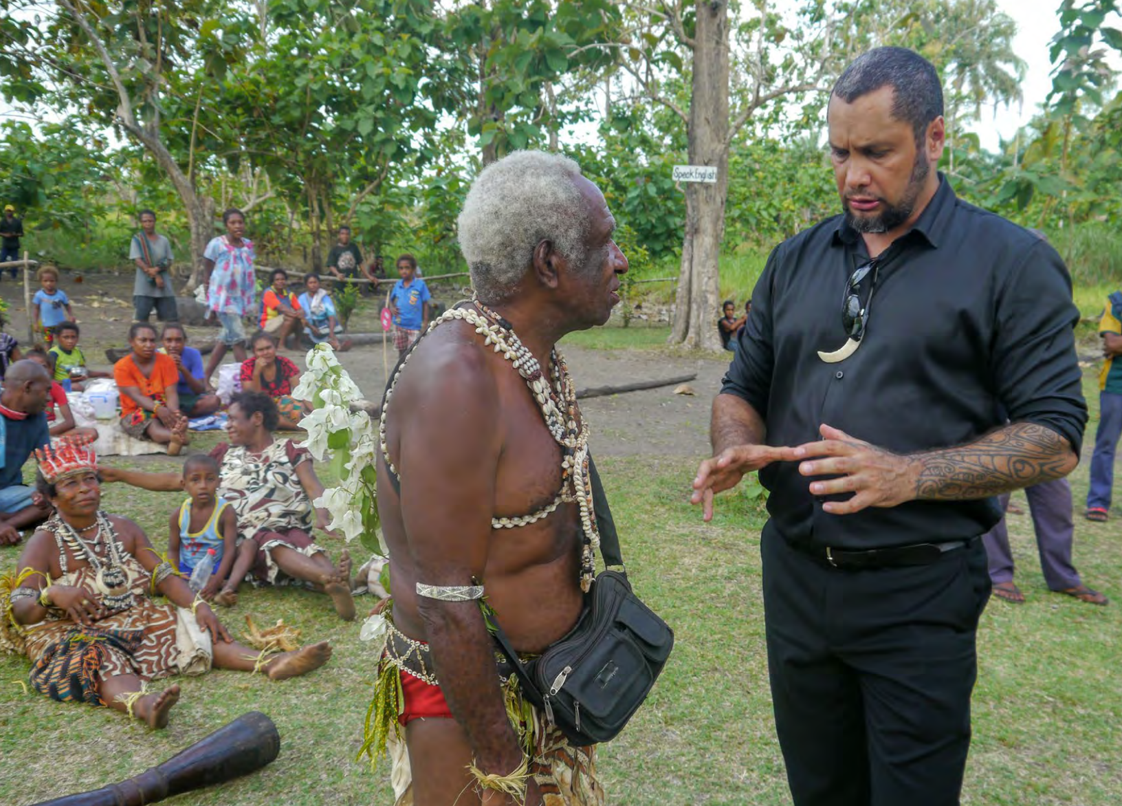
Hon. Gary Juffa, Governor Oro Province