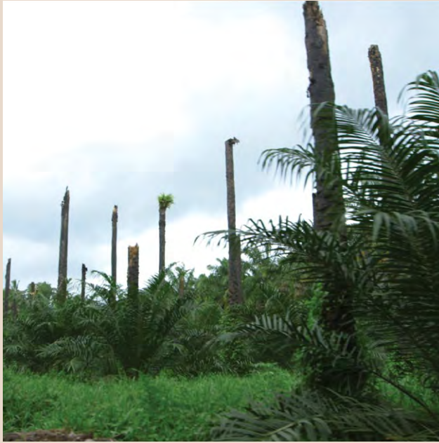
Poisoned coconut trees to be replaced by palm oil trees

that the root system does not go in because they cut down all the trees that had stopped soil erosion before. There's now flooding that impacts the coastal communities. This hasn't happened before, and the soil has been washed down to where the reefs are and damaged the reefs. Oil palm is not something that I want in my province.