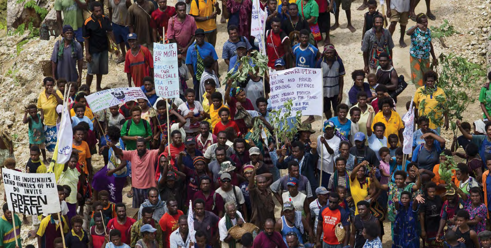
Customary landowners from Pomio villages converging for a protest